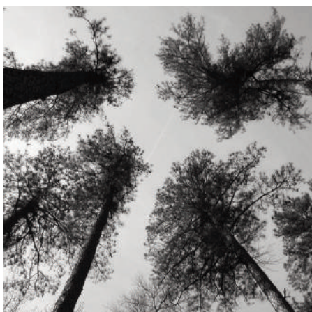
Pinus taeda (loblolly pine) and pinus palustris (longleaf pine) dominate Hitchcock Woods.

since the program began in the early 1990s. The dry spring limited the number of growing season burns we were able to conduct. All of the units we burned since have greened up and the results are very satisfying. In support efforts, we re-established the firebreak along Hitchcock Parkway to prevent grass fires along the highway from spreading into the Woods ... and we finished establishing a fuel break behind the Foxchase neighborhood.