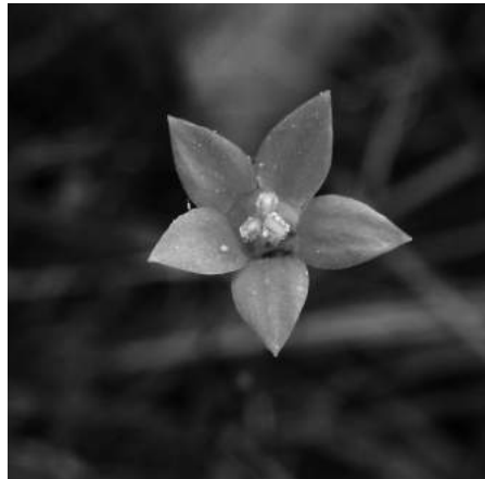
Wahlenbergia marginata, southern rockbell

Woods, the Aiken Fall Steeplechase Fete, and the Knowles Bowl – the Foundation embarked on some exciting new fundraising initiatives and events this past year.