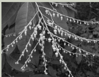
Oxydendrum arboreum, sourwood