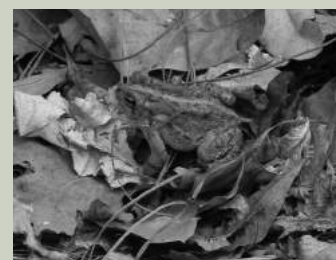
Bufo americanus , American toad