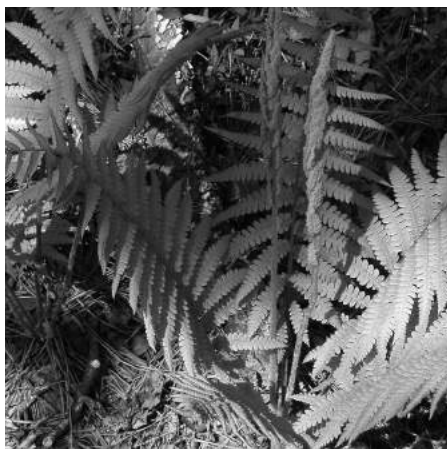
Osmunda cinnamomea, cinnamon fern