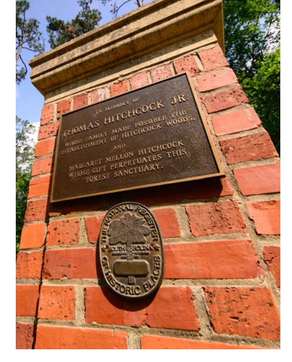
These commemorative plaques adorn Memorial Gate in the Hitchcock Woods.

In recent decades, the Foundation acquired more than 900 additional acres through the purchase or donation of adjoining tracts. With more than 2,100 acres today, Hitchcock Woods is