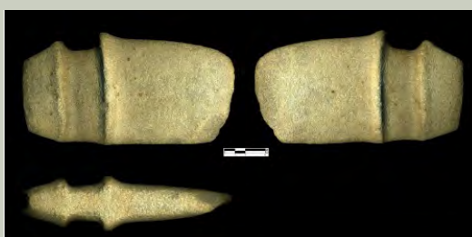
Ground stone axe from the Late Archaic found in the Hitchcock Woods.

Also last January, we began the first year of a three phase cultural inventory study of the Woods which will result in a comprehensive Cultural Management Plan for the Woods. It's pretty exciting to know that 11,000 years ago there were Native Americans living in Hitchcock Woods and making survival tools that will become a part of the story of the Woods. The study and the story are a continuum from the prehistoric to historic, and it is equally exciting to find earthenware made in the Woods during the Civil War by a potter who was filling the need to supply pottery locally as a likely result of blockades against the South. It is going to be a