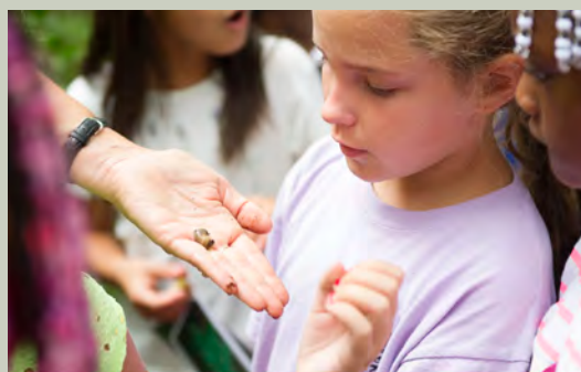
Students observe a snail on an Eco-Hike with the Ruth Patrick Science Education Center.

Education- Thanks to a partnership with the Ruth Patrick Science Education Center, the Woods served as an outdoor classroom for 661