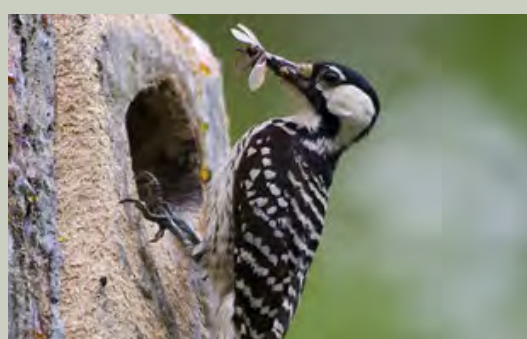
In January 2015 the HWF entered into a Safe Harbor agreement with the U.S Fish and Wildlife Service.

This past winter, the Hitchcock Woods Foundation signed a Safe Harbor agreement that will aid in local recovery efforts in Hitchcock