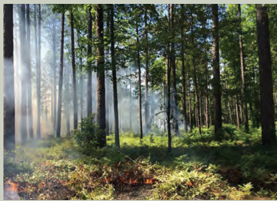
The Woods benefited from one of the highest prescribed burn seasons on record.