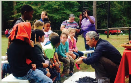
Students learn how early Woods users survived off the land during a Woods Field Day Event.

Education and Stewardship – The Woods continue to serve as a classroom for hundreds of students annually, helping to nurture our next generation of stewards. Our Cultural Resources Survey inspired our first Cultural and Natural Resources of Hitchcock Woods School Field Day Event, thanks to the help of our growing network of community and agency partners.