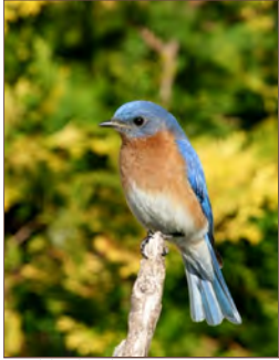
A bluebird resting it's wings

The Foundation is delighted with the success of this partnership, and was honored to be presented with the Corporate Member of the Year Award by the SC Bluebird Society in November.