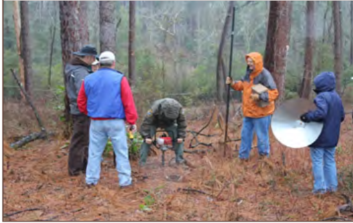
A group installing new bluebird boxes in Hitchcock Woods