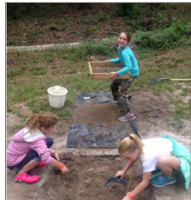
Simulated Archaeological Dig, SRARP