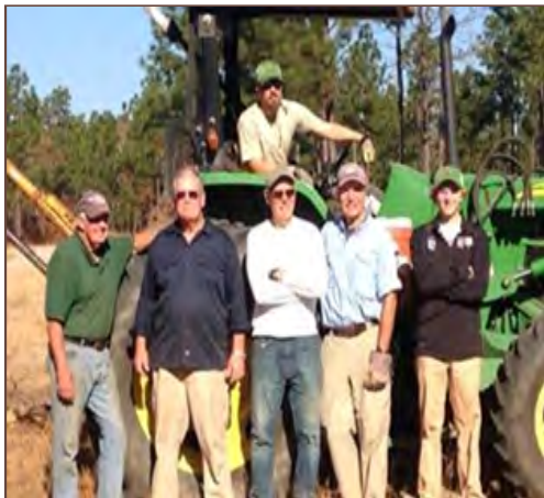
Axe Men worked alongside Wood Staff to rebuild the Fences.

Hats off to a TREMENDOUS staff, donor, and volunteer team effort!