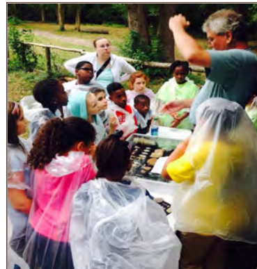
Cultural Resources Survey Artifacts, DRP and SCDHEC