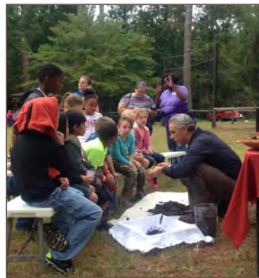
Primitive Hunting Skills, SCDNR

In addition to being outdoors and enjoying a picnic under a big tent in the middle of the Woods, students learned about the ecology and rich history of the Woods through hiking and engaging in a variety of hands-on learning stations.