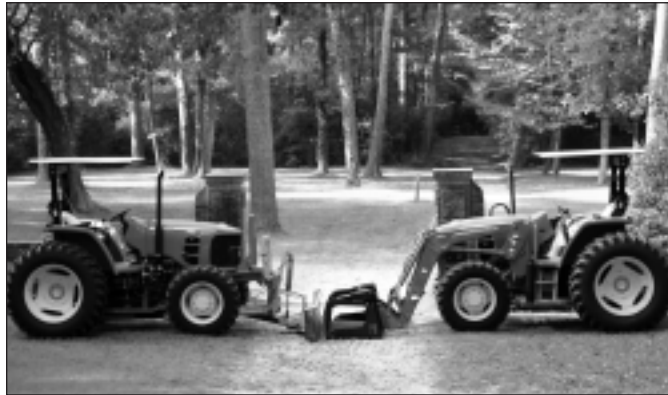
Derrick Equipment Company extended nonprofit discounts and adjusted the sale price of two new John Deere tractors and was a Diamond Sponsor of the 2010 Aiken Horse Show.