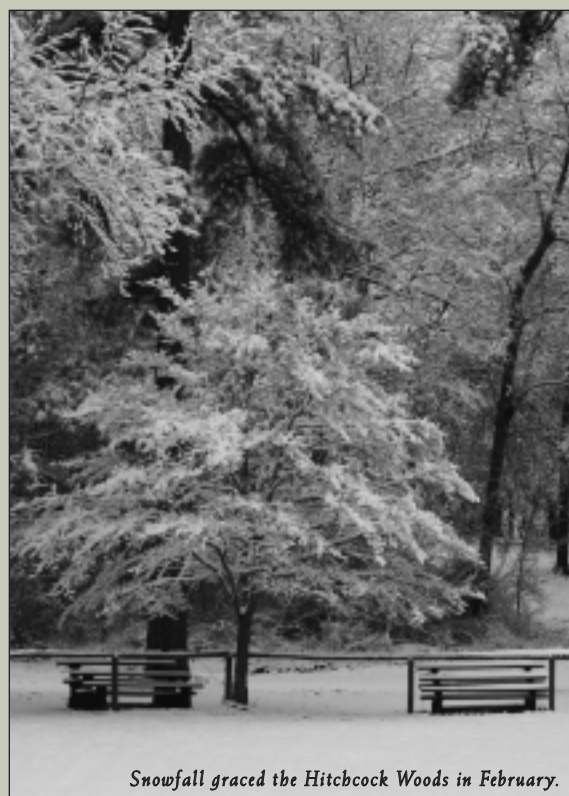
Snowfall graced the Hitchcock Woods in February.